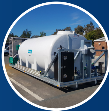
Stand-Alone Tank Unit