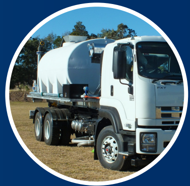
Flexible Fleet Management

1800 620 154 www.allquipwatertrucks.com.au