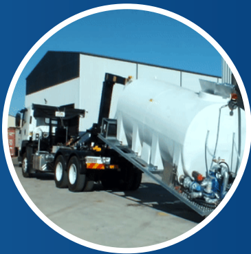
Hooklift Tank Assembly